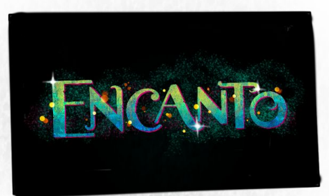
"ENCANTO" falls (Hower & green dust effect)