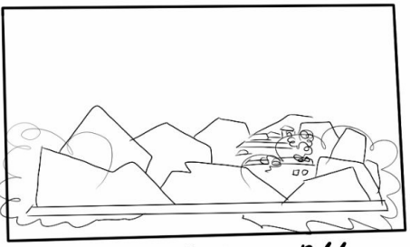
mountain of house talls